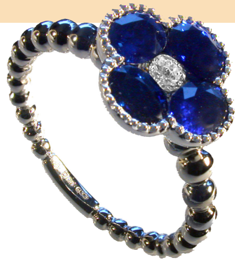
18Ct Sapphire and diamond white gold flower ring

We also stock a wide range of jewellery and gift items suitable for any occasion.